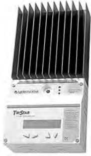
TriStar TS-45 with Meter

We now carry the full line of Morning Star charge controllers: the TriStar, ProStar, SunSaver and SunGuard charge controllers as well as the SunLight lighting control. The TriStar will fit into any of our pre-wired power panels or charge controller panels. It is fully protected (short circuit,, reverse polarity and overload) and is rated at 45 or 60 amps at