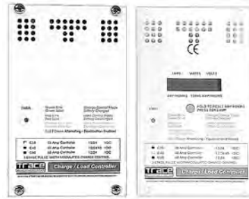
Charge Controller Kit #1: C35 and CM Digital Meter

This kit consists of a Trace C35 charge controller and a Trace CM meter set. The CM digital meter takes the place of the original C35 cover plate. This has what you need for a small cabin PV system or an RV system. The C35 can handle up to 35 amps at either 12 or 24 volts DC. The C35 has integral over current protection. If an over current condition is present, the C35 shuts down, and restarts automatically when the condition is removed. For added safety, a fuse should be added between the controller and the positive wire to the batteries. See page 32 for more information on the C35.