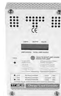
C35 Charge Controller with CM Meter attached.