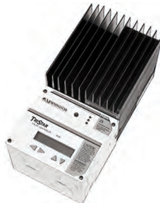
Tri-Star MPPT Charge Controller with attached digital meter.