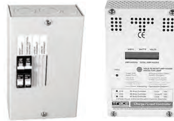
Charge Controller Kit #2: Big Baby Box and C35 + CM Meter

This kit consists of a Trace C35 charge controller, a Trace CM meter set and a MidNite "Big Baby Box" with two circuit breakers. This kit is the same as Kit #1 with the breakers included for a main disconnect and array disconnect. There is room for two more circuit breakers for DC loads. The Big Baby Box also includes a negative bus-bar. You do the wiring.