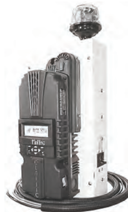
Charge Controller Kit #4 with Classic 150

Charge Controller Kit #4 has an MPPT charge controller mounted on the door of a MidNite Mini-Disconnect panel. The controller disconnect is a DC circuit breaker breaker sized for the charge controller (60A to 90A). The array disconnect is also a DC circuit breaker sized for your array download. The breakers are labeled as to function and voltage. A 10' #4 or #6 AWG cable with lugs for connection to the battery bank is included. A MidNite Lightning Arrestor is also wired on the array input terminal strip. All wiring and circuit breakers are in place and ready to go. Just run the array cable in from the solar modules and connect the battery cable to the battery bank. CC Kit#4's can have one to three breakers added for DC loads.