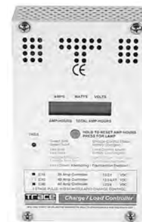
C35 Charge Controller with CM Meter attached.