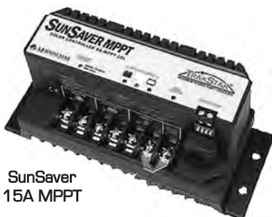
SunSaver 15A MPPT