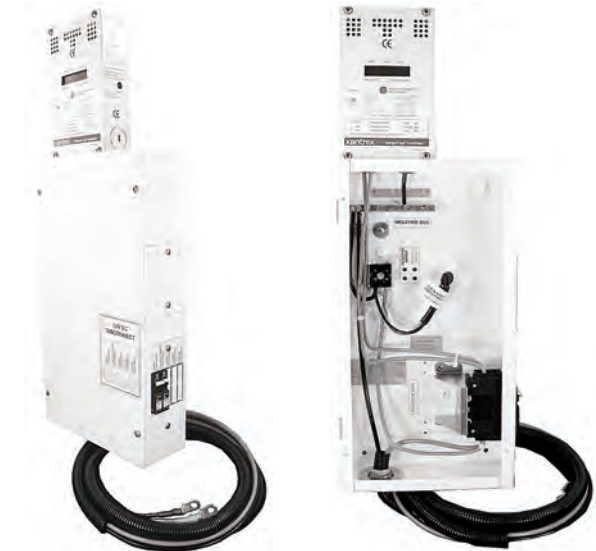
Charge Controller Kit #3: Exterior and Interior Views

Up to three additional DC circuit breakers can be added to this assembly for DC load circuits. This makes the CC Kit #3 an ideal complete solution for DC wiring in a camp or cabin.