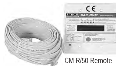
CM R/50 Remote