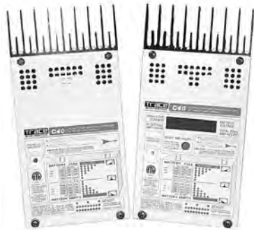
C40 without CM on left and with CM on right.

The C35, C40 and C60 charge controllers are 3 stage solid-state, pulse width modulated devices. They work as charge controllers, DC load controllers or DC diversion regulators. They are electronically protected for short circuit, overload, over-temperature and reverse polarity conditions. They will control 12V, 24V and in the case of the C40, 48V PV systems. They feature field adjustable set-points, automatic or manual battery bank equalization settings and status LED indicators. As their names suggest, the C35 is rated for 35 amps, the C40 for 40 amps and the C60 for 60 amps. But they will actually control up to 60 amps before they self limit. They each have automatic high current overload protection which simply turns the unit off until the high current condition is removed. Restart is automatic. Each can be fitted with a digital meter as an option which monitors battery bank voltage, array current and amp-hours.